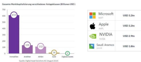
Figure 3: Crypto market capitalization vs. traditional asset classes

In the current investment environment, digital assets offer unique potential. A glance at global assets under management shows that digital assets are underrepresented in most portfolios, which significantly increases their upside potential due to their low market capitalization. At just over USD 2 trillion, the total market capitalization of the blockchain sector is still well below that of other asset classes and is in fact smaller than the capitalization of some large tech companies.