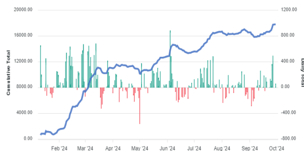
Figure 1: Cumulative (blue) and daily (bars) flows of US Bitcoin ETFs

The US elections in November will also have a short-term impact on crypto prices. While presidential